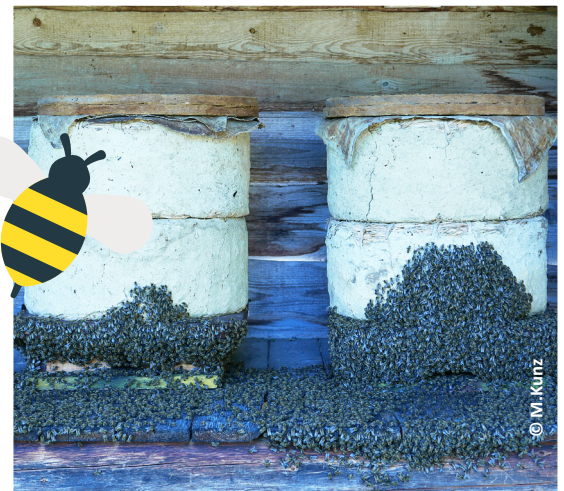
Until the middle of the 19th century, bees were mostly kept in woven skeps, sometimes with mud covers. When it’s too hot, bees form a ‘fan’ outside and use their wings to blow cool air into their hive

Fortunately, when we look at the number of honeybee colonies in the world, we see their numbers are increasing. That’s because they are so resilient and because there are still plenty of areas where there aren’t so many people, and where agriculture is not as industrialised as in Europe.