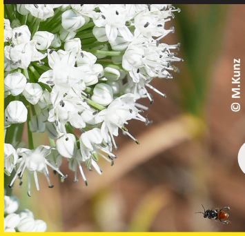
A stingless bee (bottom right) approaching an onion flower. Note how tiny it is!