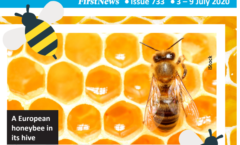
A European honeybee in its hive