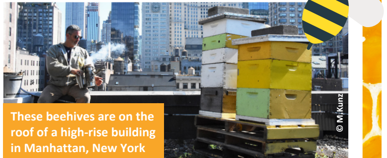
These beehives are on the roof of a high-rise building in Manhattan, New York