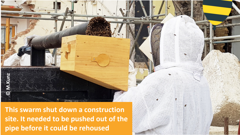
This swarm shut down a construction site. It needed to be pushed out of the pipe before it could be rehoused