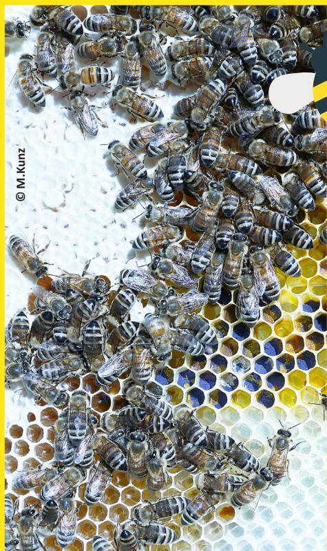
Here you can see honey stores (top left: white already with a lid; bottom left: open) and cells with pollen (centre). The hexagonal structure provides maximum strength with the minimum of material