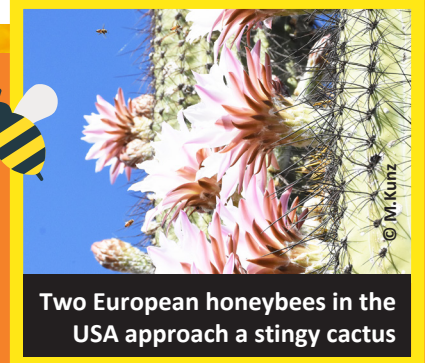
Two European honeybees in the USA approach a stinging cactus

Remember, a colony acts like a single animal – and it gives birth to a new one. This is called swarming, and is very different from, say, a dog having a pup. You